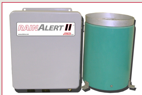
The ADS RainAlert II Rainfall Gauge with tipping bucket provides automated remote rainfall gauging and alarming.